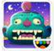
Toca Music House