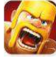
Clash of Clans